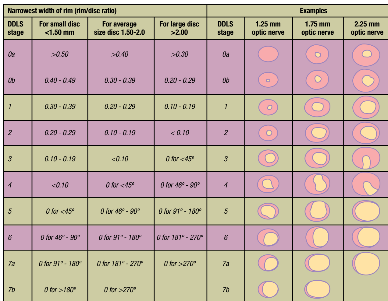
Figure 2. The disc damage likelihood scale (DDLS).

With regard to the photographs, the intraobserver and interobserver reproducibility was better using the DDLS than the cup/disc ratio (98% versus 85% for intraobserver reproducibility, and 85% versus 74% for interobserver reproducibility). The DDLS correlated better with the Humphrey Visual Field than did any Heidelberg Retina Tomograph parameter.