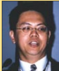
Dr ST Hob Singapore National Eye Centre Singapore

Clinical examination of the optic disc and nerve fibre layer, and fundus photography are the most common methods for detecting and monitoring structural changes in glaucoma. However, these methods are subjective and only semi-quantitative. Recent advances in computer-based ocular imaging technology provide an objective and quantitative means for detecting structural abnormalities of the optic disc and RNFL.